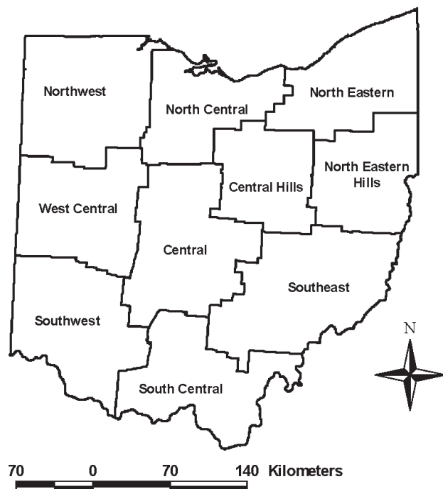
FIGURE 1. Map of the 10 weather regions of Ohio.

The maps obtained with Kriging show predicted counts which are indexes of abundance. The northern bobwhite range in Ohio