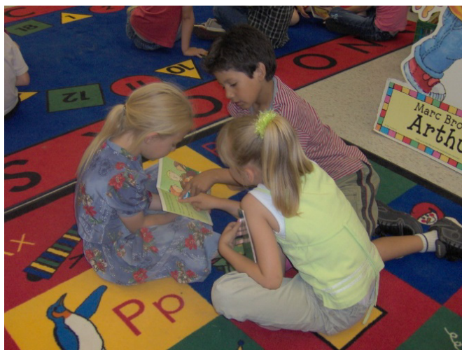
Figure 2: OCM Children in an Ontario Classroom