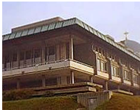
Serbian National Library Belgrade, Serbia and Montenegro