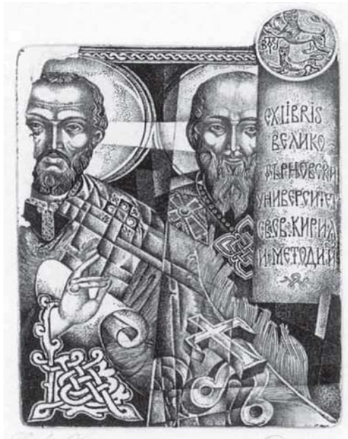
Bookplate of the Veliko Turnovo "SS. Cyril and Methodius" University

24 May (Old Style 11 May) the feast day of SS. Cyril and Methodius "Apostles to the Slavs" and the Founders of Slavic Literacy