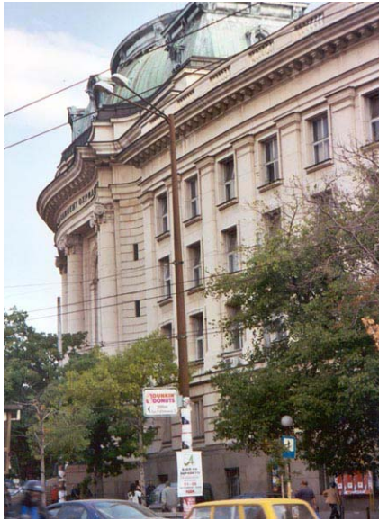
Sofia University "St. Kliment Ohridski"