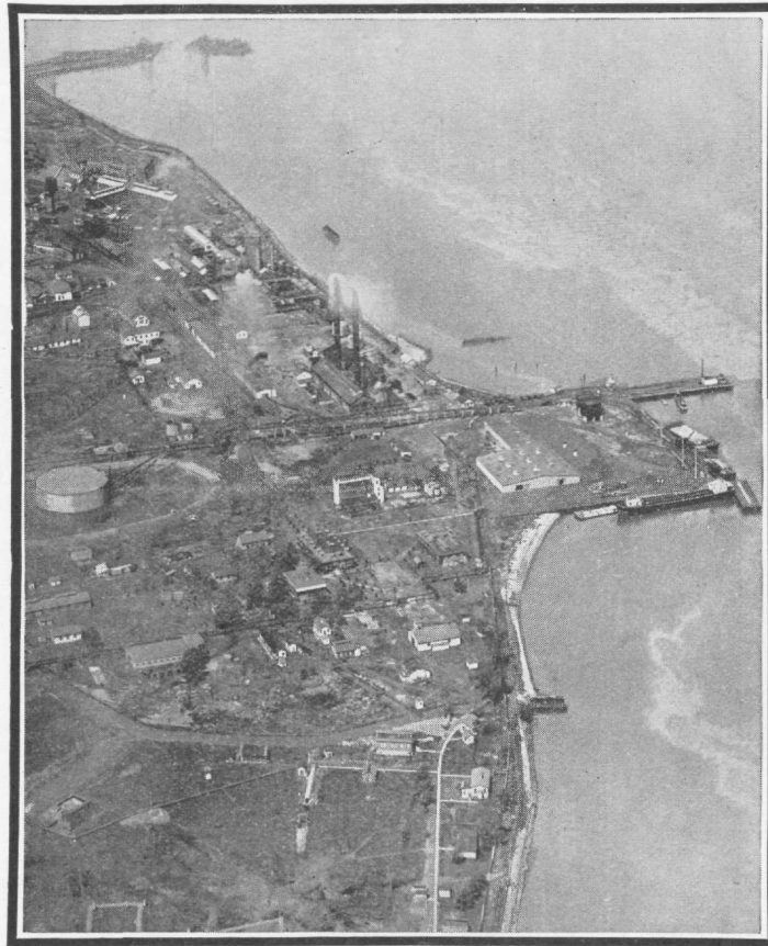
The river front area of the Repauno dynamite plant near Gibbstown, New Jersey, where the du Pont Company first began manufacturing high explosives