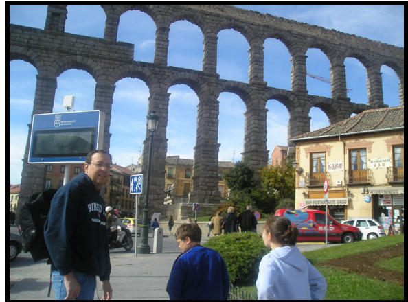
2,000 year old Roman Aqueduct in Segovia