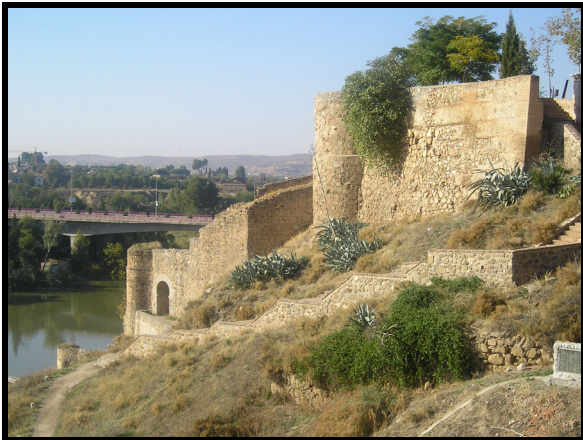
Medieval city walls of Toledo