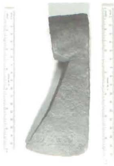
Figure 8 (Murphy)