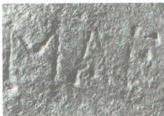
Figure 5 (Murphy)