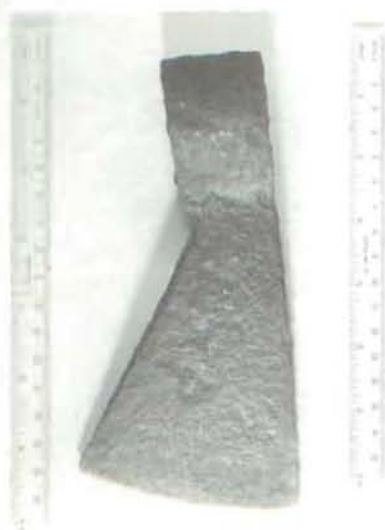
Figure 7 (Murphy)