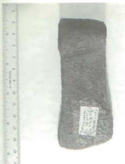
Figure 1 (Murphy)