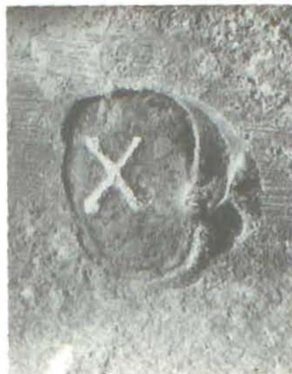
Figure 3 (Murphy)