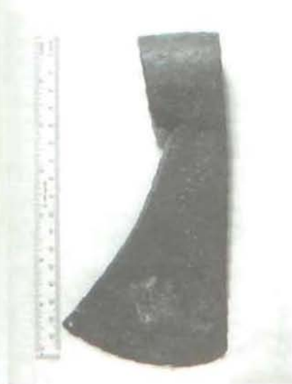
Figure 4 (Murphy)