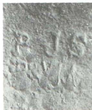
Figure 10 (Murphy)