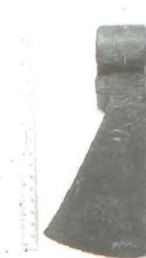
Figure 6 (Murphy)