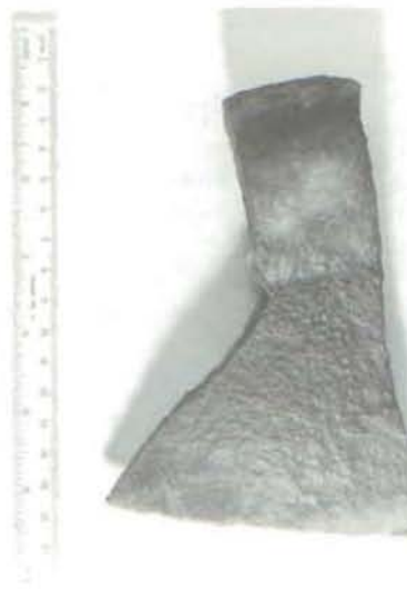
Figure 9 (Murphy)