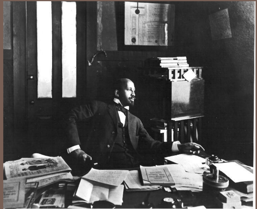
W.E.B. DuBois, founder of the NAACP and opponent of imperialism: "In college I replaced my hitherto egocentric world by a world centering and whirling about my race."