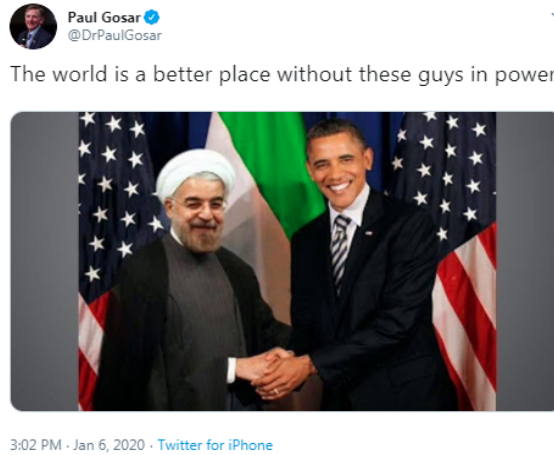
Figure 3: Photoshopped image of President Obama and Iranian President Hassan Rouhani. Rouhani was photoshopped into the image, which originally showed President Obama with Indian Prime Minister Manmohan Singh. 74

If someone wants to counter-speak against this image, how can they reach the same audience? As of this writing, Rep. Gosar’s tweet has been favorited 22,200 times and retweeted 6,500 times. Thousands of people commented on it, as well. This means that all of the followers of all of the people engaging with it by commenting, favoriting, or retweeting, also may have seen the image. Only Twitter knows who saw the image on its platform. If President Obama, President Rouhani, Prime Minister Singh, or even a group of “Photoshoppers for Democracy” wanted to counter-speak to the same audience, they could not. At best, commenting on the post is a chance to counter-speak, but the comment only goes to followers of the person commenting and anyone scrolling through the comments of the photo after a person comments. Thus, in this context, it is impossible for anyone to