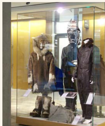
Flight and polar research suits