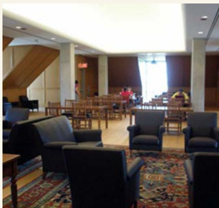
11th floor lounge and reception area