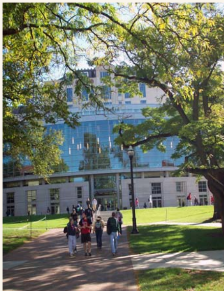
New glass addition features Neil Avenue entrance, the Buckeye Reading Room and the Berry Cafe