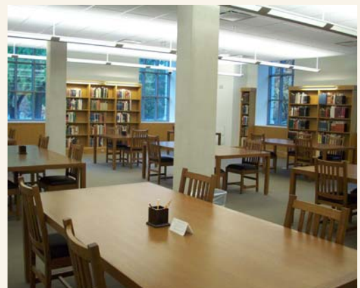
Special Collections Reading Room