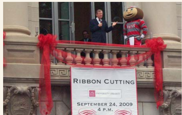
OSU President E. Gordon Gee shares ribbon cutting spotlight with OSU mascot, Brutus Buckeye

The new space includes the historically recreated reading tables, recreated balconies, and new windows that overlook the Oval. The new glass addition on the west side incorporates another large reading room that represents a contemporary interpretation of the historical Grand Reading Room. The addition also contains a café, flexible study spaces and allows convenient access to the library on the west side.