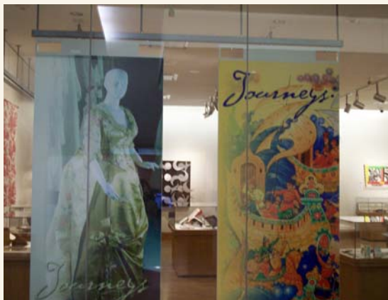
Journeys: Treasures of The Ohio State University Libraries Special Collections displayed until 1/03/2010