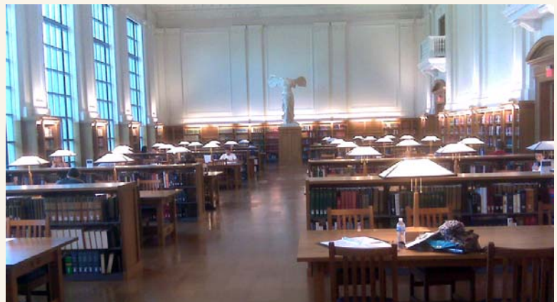
The Grand Reading room includes historically recreated reading tables, balconies and new windows that overlook the Oval