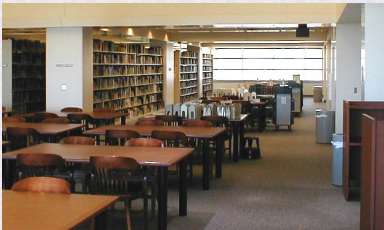
Biological Sciences/Pharmacy Library