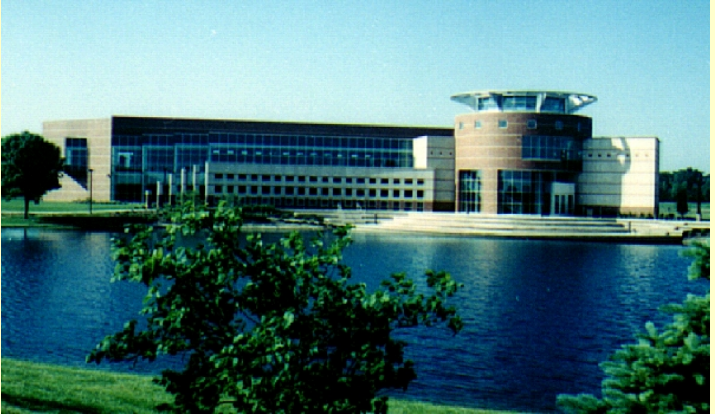
Library at OSU-Marion