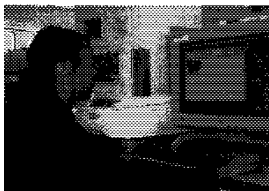
A student worker in the Digital Library manipulates an image from the Texas Agricultural Extension Service collection.

Despite these issues, the scanning phase was completed well ahead of schedule, and students began working on other projects while the database was being completed. Cleanup began, but it was complicated by