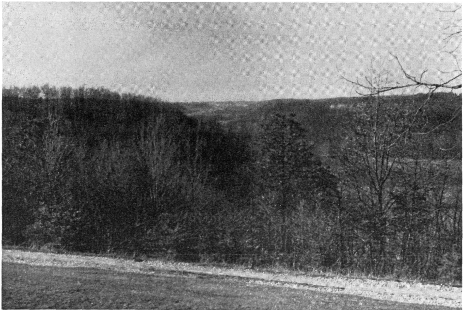
FIGURE 1. View showing nature of peneplain-like upland surface; picture taken one mile west of Rockbridge in Goodhope Township, Hocking County, looking north up Hocking valley.

Investigation of the geologic setting of a few of the upland flats (stratigraphic information courtesy of G. H. Denton, H. R. Collins, B. E. Smith, R. M. DeLong,