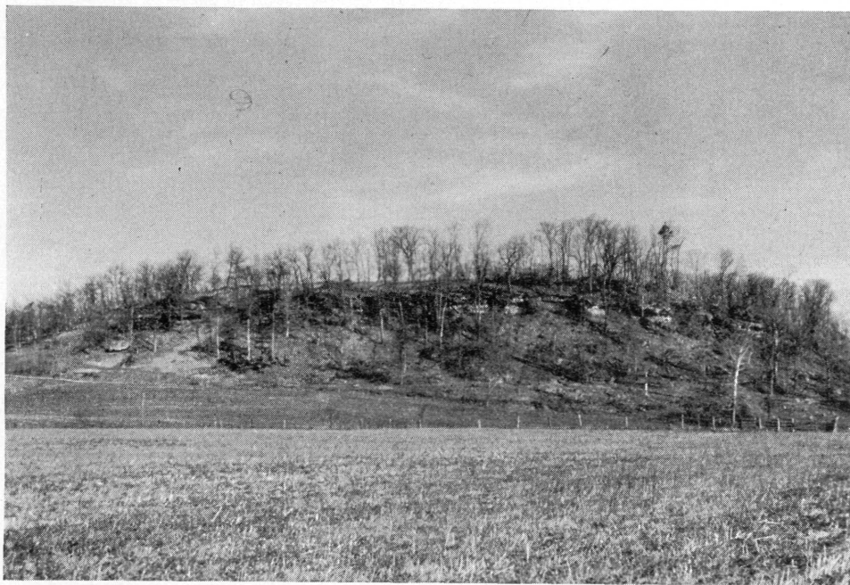
FIGURE 2. View showing same flat upland surface illustrated in figure 1 with underlying Mississippian Black Hand sandstone believed to be responsible for the development of the surface; picture taken from route US 33 near Sugargrove in southern Berne Township, Fairfield County, looking northwest.

Where the resistant layers of sandstone crop out only below the general upland level, striking rock terraces or local rock-controlled benches are produced on the sides of the hills, as shown in figure 4. In such areas or in areas where the sandstone at the level of the upland is thinner, persistent upland flats are absent; the