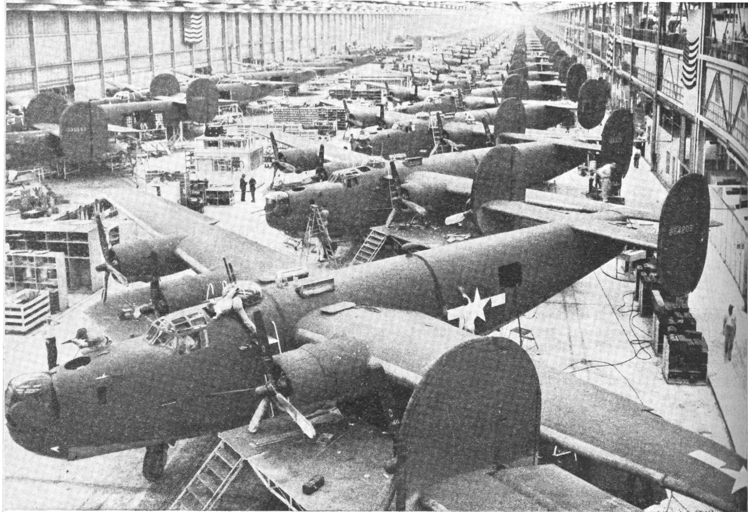
Turret on Liberators