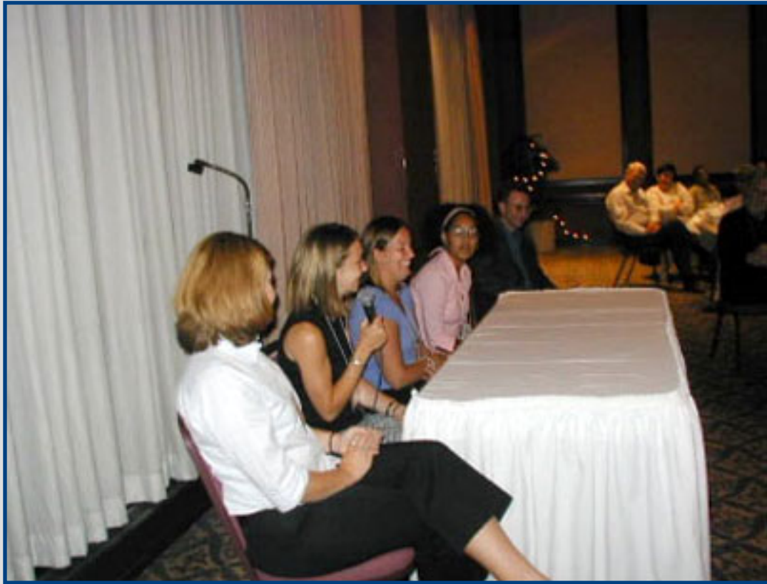
In Toledo, the scholars interacted with Toledo area high school students at a dinner, reception and panel discussion sponsored by the Young Scholars Program.