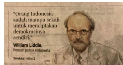
The front page of Media Indonesia , a leading Jakarta daily, on July 16. The caption says "Indonesians are quite capable of creating their own democracy."