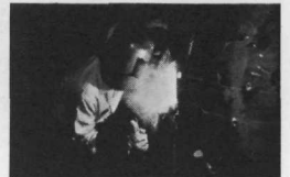
McGill Fabricated Products specializes in high quality plate and structural custom fabrications.