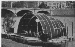
United Flotation Systems designs, manufactures and installs industrial and recreational floating structures.