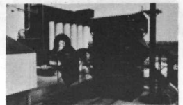
McGill Precipitator Systems' unique electrostatic precipitator solves industrial air pollution control problems.