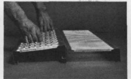
United Interlock Grating produces a metal plank grating for stairs, walkways, platforms and shelving.