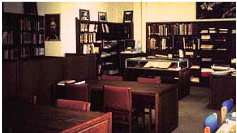
Inside the Hilandar Research Library

Medieval culture is most extensively recorded in written manuscripts, each of which is a unique creation. If these were not preserved, no one would know of them or be able to learn from them. All in all, these materials have been little studied and still have much to offer.