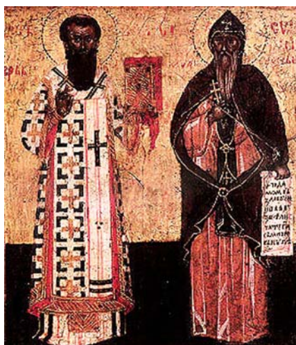
Icon of SS. Simeon and Sava