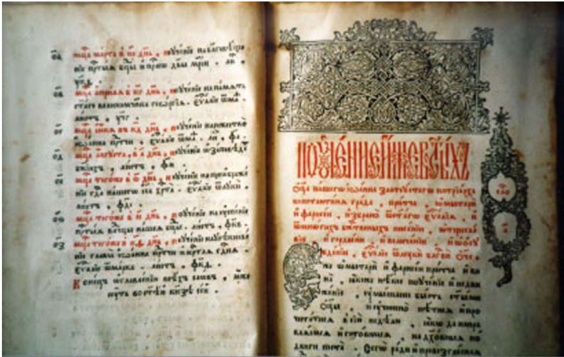
The Hilandar Research Library was given first opportunity to purchase this copy of the Instructional Gospel printed in Moscow on June 12, 1652. It contains an inscription from the 1650s by a cleric of the Church of St. Nicholas the Miracleworker, possibly of the village of Lutsyn. This was the penultimate book printed in Russia before the Nikonian reforms and, therefore, is an important addition to the HRL collection.

Hilandar Research Library Resource Center for Medieval Slavic Studies The Ohio State University 225 Main Library 1858 Neil Avenue Mall Columbus, OH 43210-1286