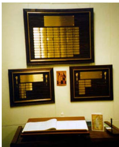
Plaques in the HRL recognize donors.

Contributions support the HRL/RCMSS in its efforts to promote medieval Slavic studies. All gifts are tax deductible to the extent the law allows. Checks should be made payable to The Ohio State University; indicate HRL/RCMSS in the memo section.