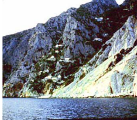
Mount Athos, Greece

No, but everything is related to Slavic culture. Only 9 of the 73 collections are