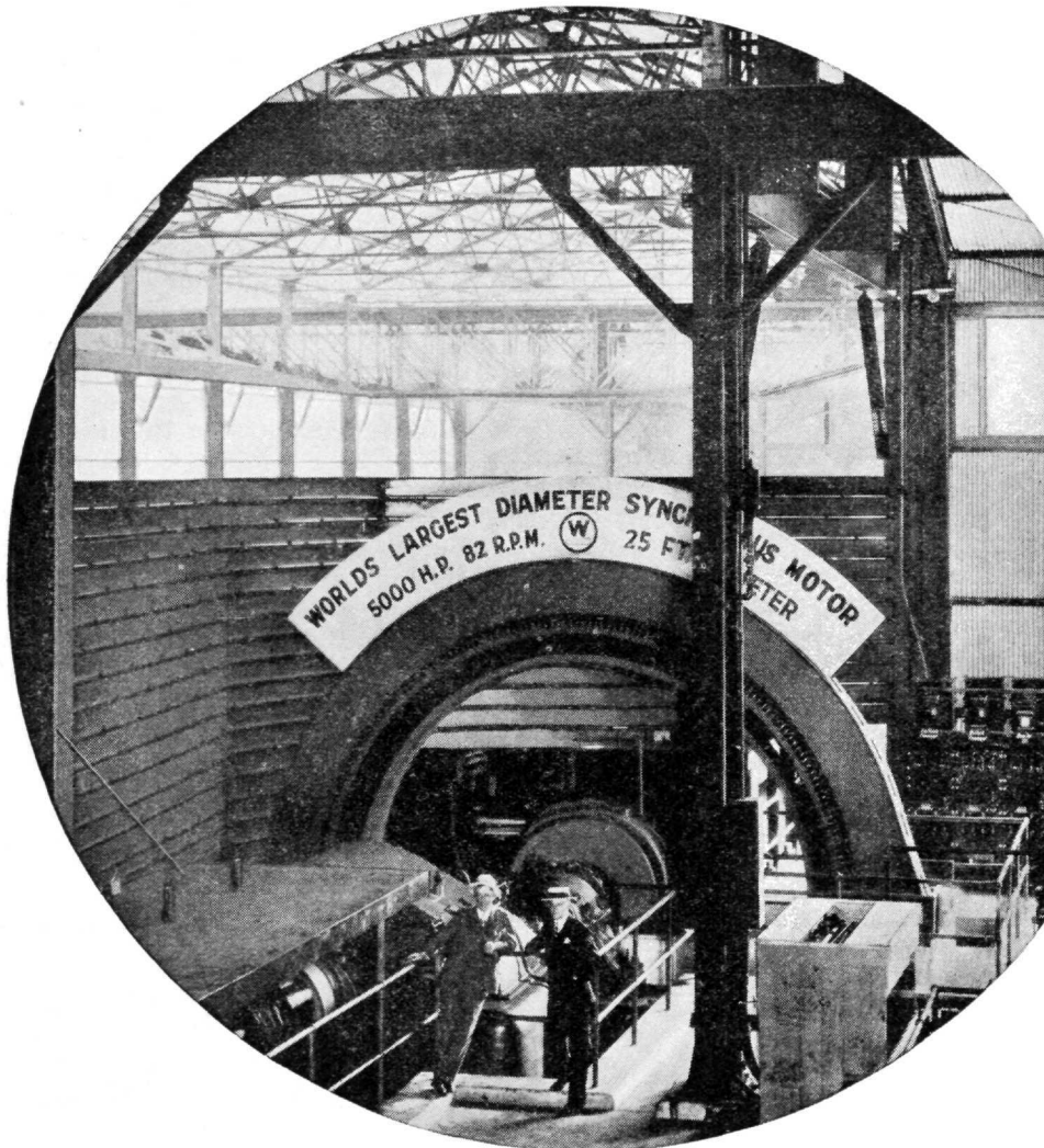
This 5000 h.p. motor in the Columbia Steel Company's Plant, with its frame of arc-welded steel, is physically the largest synchronous motor ever built.