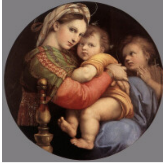
Figure 3 Madonna della Sedia, Raphael

The odalisque in Grande Odalisque achieves the status of the ‘whore’ archetype in Raphael’s Fornarina through the sensuousness use of translucent fabric, the figure’s inviting gaze, and her hand placement, which focuses the eye onto her breasts and genital region. The depiction of the odalisque’s smooth, languid nude body (like Fornarina ) and her situation within an ‘exotic’ setting (the turban, rich fabrics, jewels, and featured fan) are enough of the proper romantic voyeurism that characterizes the desirous Orientalist and male gaze as defined earlier by Nochlin’s quote of Edward Said. The odalisque in Grande Odalisque also achieves the status of the Madonna/mother archetype through Raphael’s desexualized female figure in his Madonna della Sedia . The nude body of the odalisque in Grande Odalisque can at the same time be viewed as asexual because the figure’s back is primarily what is displayed for the spectator with only the secondary sex