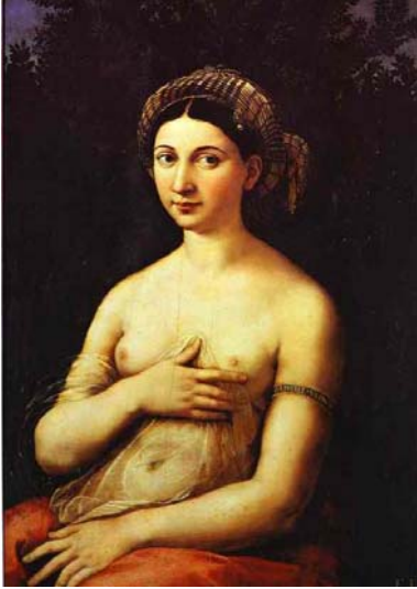
Figure 2 Fornarina, Raphael

Raphael in Grande Odalisque - as she states, “The turbaned figure [in Ingres’ odalisque] is both the sexual mistress/odalisque and the asexual Madonna/mother” (Leeks, 6).