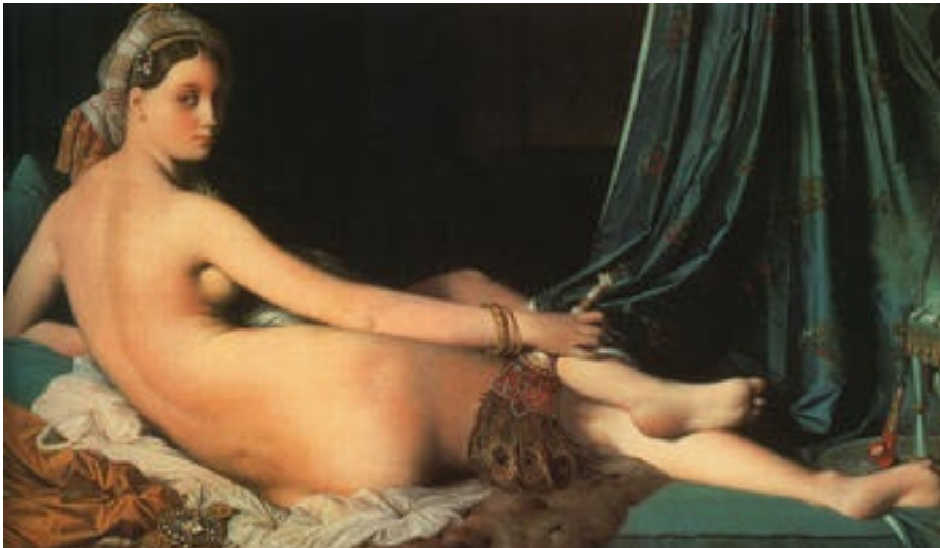
Figure 1: Grande Odalisque, J.A.D Ingres