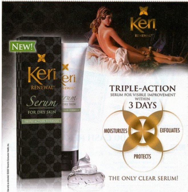
Figure 4, Keri Renewal advertisement

In a current advertising campaign, the Keri brand utilizes the image of Ingres' Grande Odalisque for their new skin-care line Keri Renewal [see Figure 4].