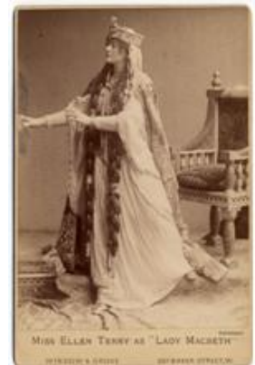
Photograph of Ellen Terry as Lady Macbeth in the 1888 Lyceum Theatre production of MACBETH.