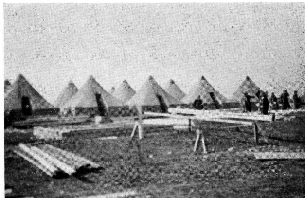
CAMP UNDER CONSTRUCTION

The main responsibility of the engineer troops was to transport the U. S. mail. The flood caused a heavy congestion of mail in Louisville and a special representative of the post office department was sent there to handle this situation. As a solution, the transportation of the mail was placed solely in the hands of the U. S. troops, with the engineers responsible for the water crossing.