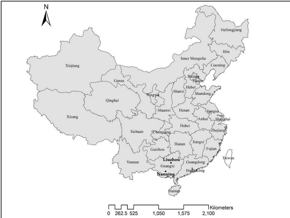
Figure 1. The study areas are located near the cities of Nanning and Liuzhou in Guangxi Province, P. R. China.