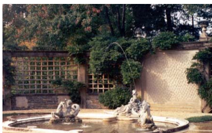
Fountain on the grounds of Dumbarton Oaks, Washington D.C., 1996

Byzantine Greek Summer School 2 - 27 June 2003 Dumbarton Oaks Washington D.C., USA www.doaks.org/ByzGrSS.html