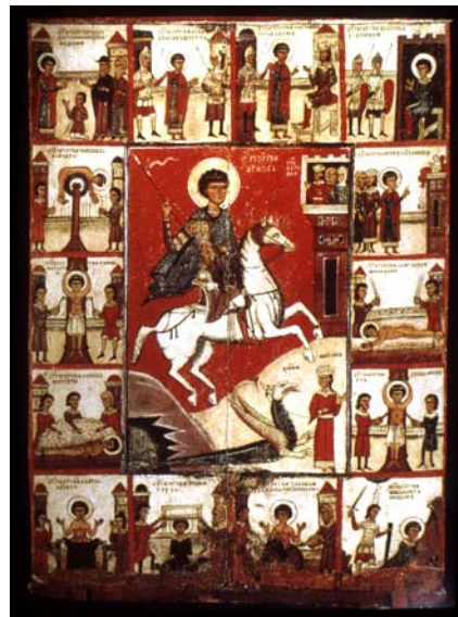
Saint George and vita, early 14th century, State Russian Museum, Inv. No. 2118

of the world's magnificent medieval cities, and offer a rare chance to examine the interaction between art and material culture in one location. Because of the variety of objects featured in the exhibition, visitors will be able to explore a number of compelling themes: Novgorod as one of the outermost cities of the Byzantine world, Novgorod as a site with intimate ties to both Byzantium and the West, Novgorod as an archaeological site capable of offering startlingly intimate glimpses of medieval life, and Novgorod as one of the great centers of icon production during the Middle Ages.