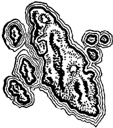
Raw material from the far corners of the world.

It's always the era of exploration in telephone work. New manufacturing processes are being developed, new sources of raw materials found, new methods originated for distributing telephone