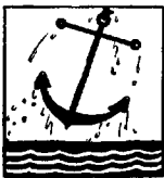
No anchoring to tradition, here.

phony . . . Intensely interesting, this work is. There is in it the spirit of the adven-