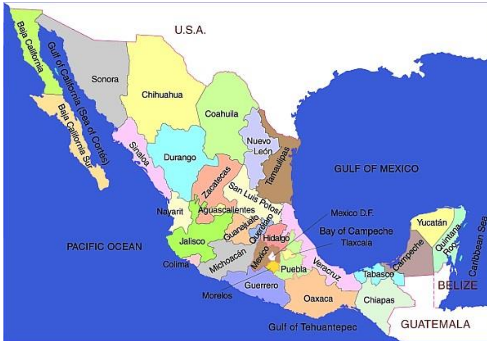
Figure 1: Map of Mexico 2