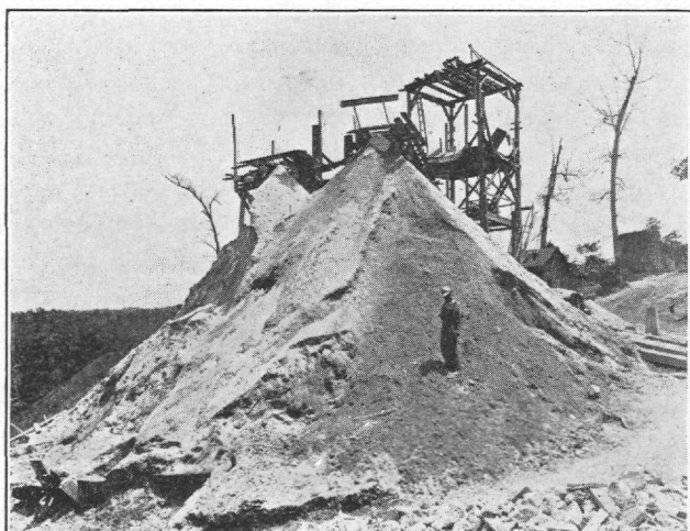
Fluorspar for 10,000 Bath Tubs