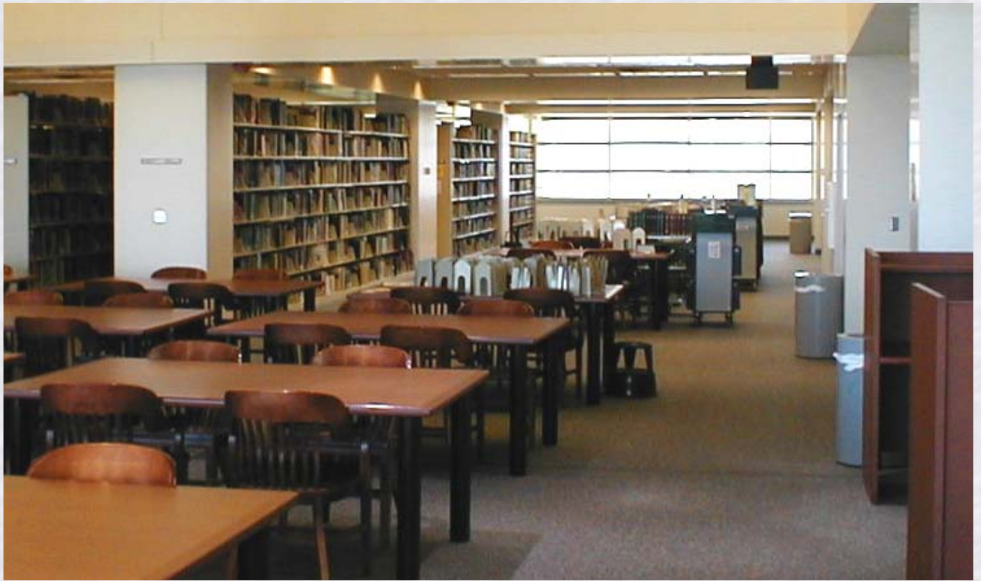
Biological Sciences/Pharmacy Library