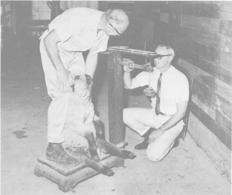
Lambs should be weighed at approximately 90 days of age

Wool Weights: Individual fleece weight for each ewe should