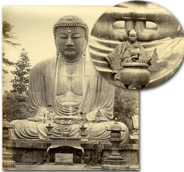
Figure 6 Yokohama, 1860s (Hockley, "Felice Beato's Japan: Places")