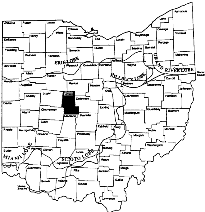
FIGURE 2. Location of glacial lobe boundaries in Ohio.

parameters, are surprisingly similar between Sandusky and Union counties. The sandy, friable Navarre Till, a mappable unit stratigraphically between the Hayesville and Millbrook tills in northeastern Ohio, appears to be absent in both north-central Ohio and the SSC area. Presence of the Navarre Till in north-central Ohio is questionable and, if present, is represented by only a thin platy till.