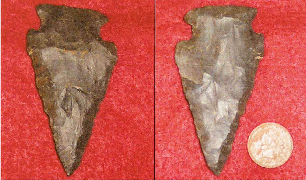
Figure 1 (Walker) Obverse and reverse sides of the Rose farm bevel.

made of Zaleski flint from quarries located in northern Jackson County and southern and central Vinton County which is north of the site where this projectile was found.