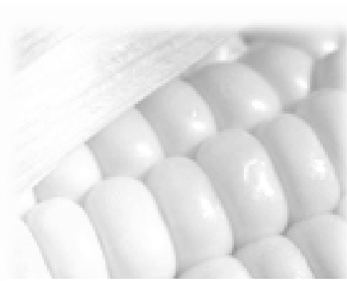
Agriculture and Natural Resources