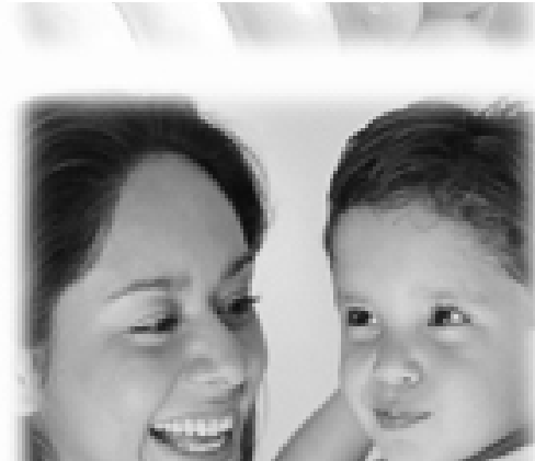
Family and Consumer Sciences