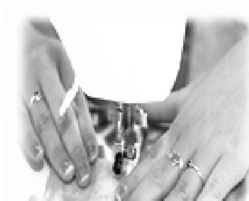
4-H Youth Development