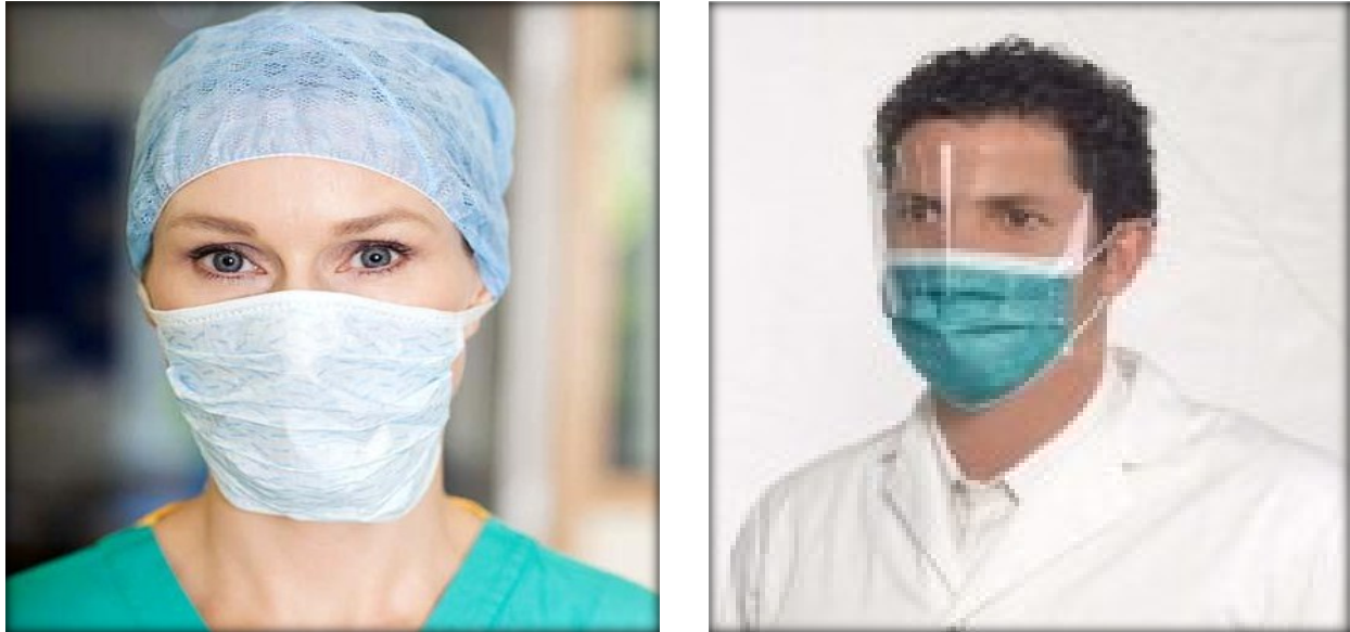
Figure 1: Surgical mask and surgical mask and blood-shield worn by health professionals in hospital operating rooms.

of all participants were then calculated for male and female talkers, unmasked, masked, and shield speaking condition, and for high predictability and low predictability sentences.