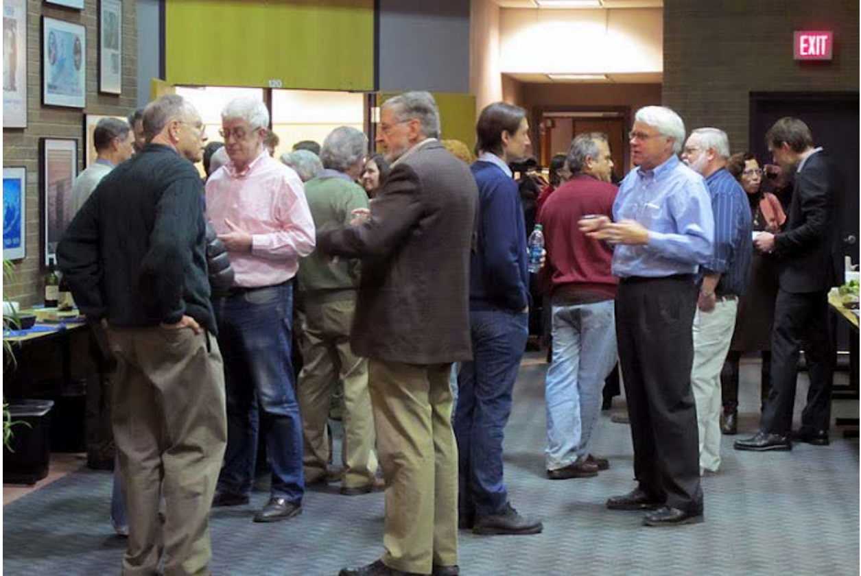
Mershon affiliated faculty members and graduates students attend a reception before the event.