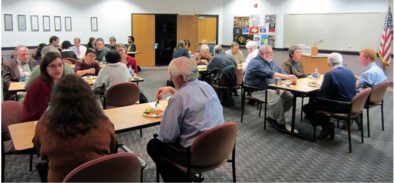
Mershon affiliated faculty members and graduate students enjoy dinner together before the event.