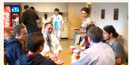
Enjoying the pizza party on the last day of the MSSSI