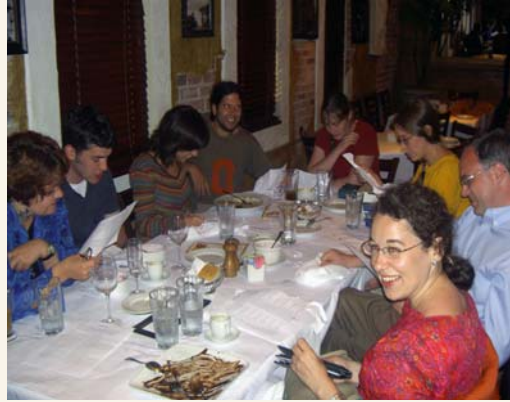
Group dinner at Bravo Cucina (Crosswoods) following the excursion to the Columbus Zoo