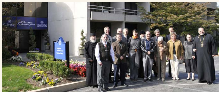
Some "Macarie 1508" Symposium participants and guests in front of the Villanova University Conference Center