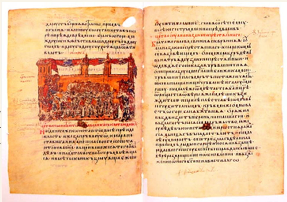
Khronika Konstantina Manasiia [Chronicle of Constantine Manasses], copied 1344-1345. Codex Vaticanus Slavicus 2. Facsimile. 2007.

Recent acquisition of the Hilandar Research Library.