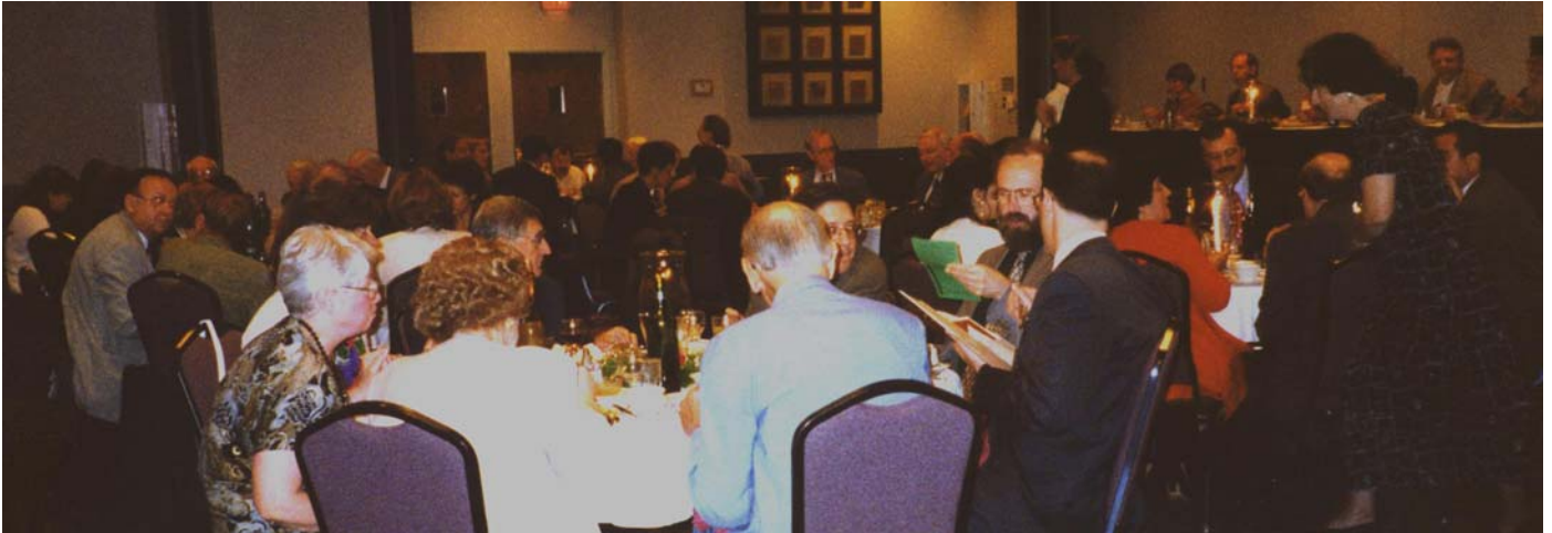
Panoramic view of the Founders' Banquet, Friday, August 14, 1998