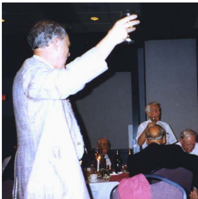
The audience raises a toast and sings "Mnogaia leta."