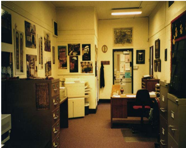
The Resource Center for Medieval Slavic Studies, 225 Main Library