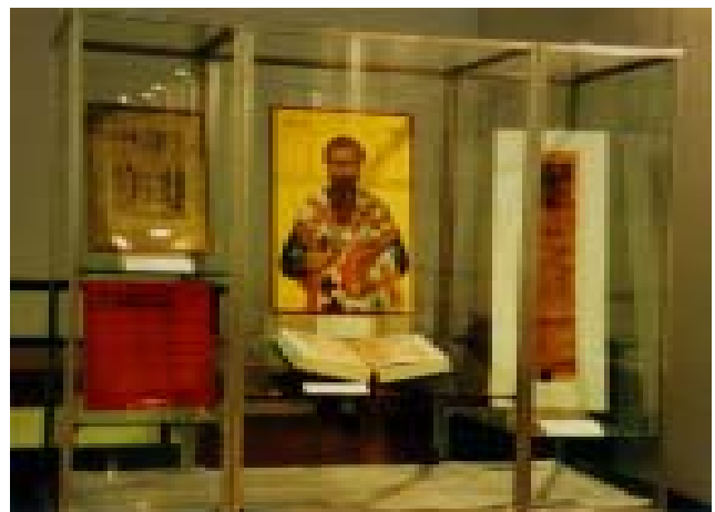
The Founders of Hilandar Monastery SS. Sava and Simeon

Fourteen poster-size pictures reproduced from slides taken during the first and second OSU photographic expeditions to Mount Athos were prominently featured on the walls of the exhibit hall. The north gallery offered a few images of life in Hilandar Monastery – contemplation, prayer, and work. In the south gallery, enlarged images of manuscript leaves selected from Hilandar Monastery Slavic and Greek manuscript and document