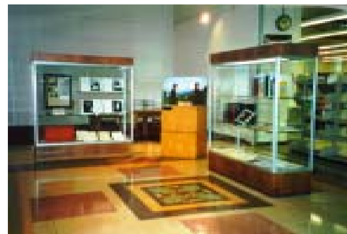
South Gallery of the Philip Sills Exhibit Hall

The last case in the south gallery, labeled “Making a Difference,” contained a selection of monographs, articles, theses and dissertations which were made possible and/or enhanced by the primary and secondary source materials, especially the manuscripts on microform, of HRL or through the support of the RCMSS.