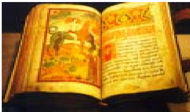
Aronov #1 - a Russian “Illuminated Miscellany” from the end of the 18th century

The south gallery included cases of modern facsimiles of medieval works interspersed with a few original old printed books and a manuscript which were gifts to the HRL. In the south gallery, opposite the standing case in the north gallery devoted to “The Founders of Hilandar Monastery,” stood another case in counterpoint – “The Founders of the Hilandar Research Library.” Brief biographical sketches of the four Founders, which focused on the role each played in establishing the HRL, were accompanied by pictures of the Founders taken at the 1978 opening ceremony of the “Hilandar Room.” Also displayed was the letter from Robert Rade Stone, Supreme President of the Serb National Federation, dated June 29, 1977, in which he guaranteed the balance of a $20,000 donation for the Hilandar Room at OSU. The punomocje (power of attorney) from Hilandar Monastery, allowing the HRL at OSU to use and share its manuscripts on micro-