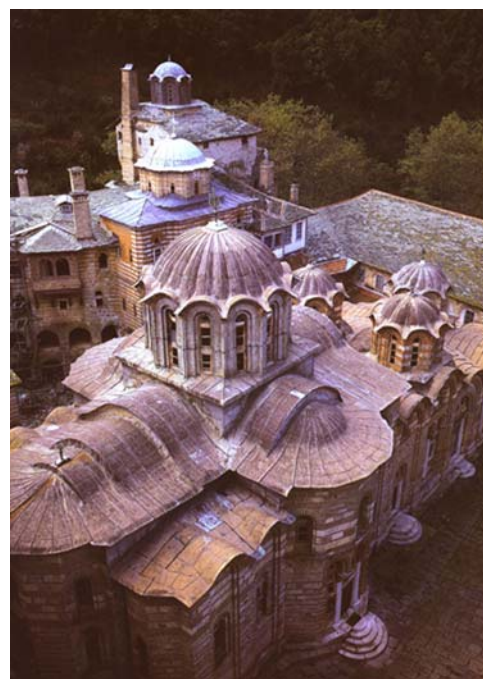
Main Church of Hilandar Monastery