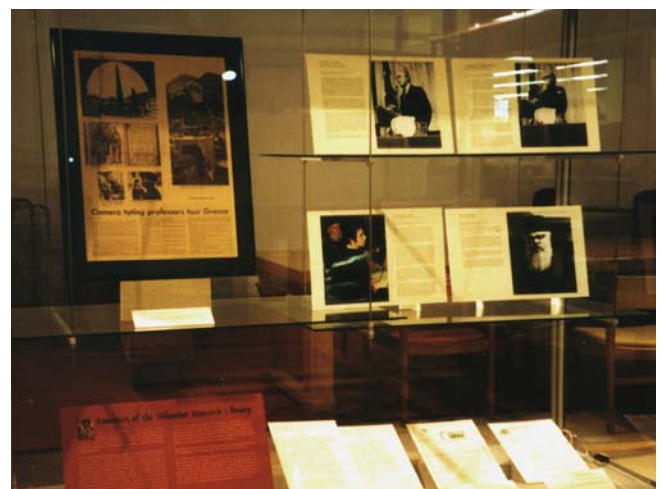
Hilandar Exhibit Case #11: The Founders of the Hilandar Research Library