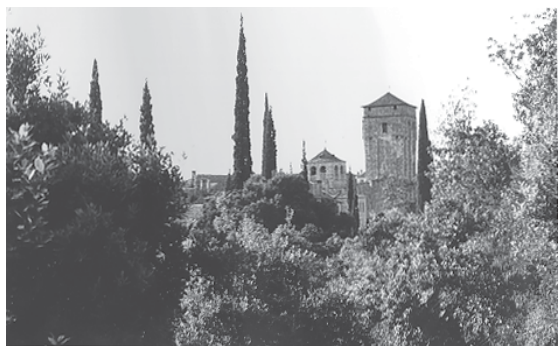
Saint Sava's Tower, Hilandar Monastery