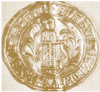
Fourteenth-century Serbian seal from Hilandar Monastery