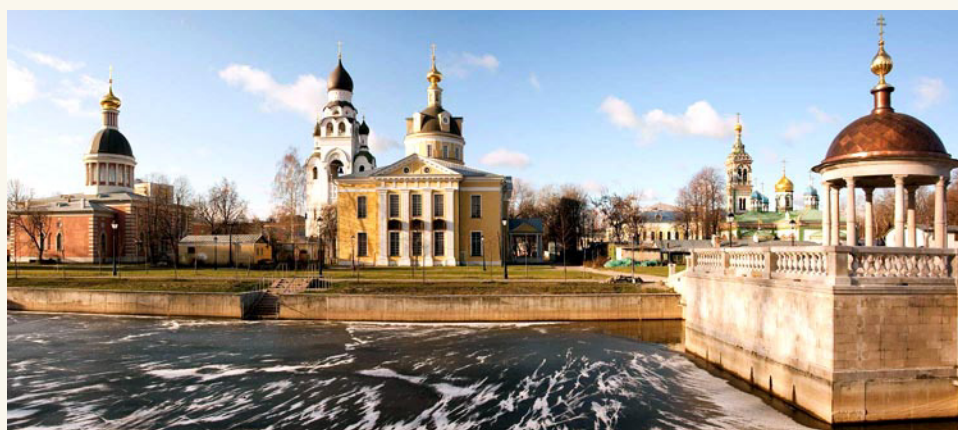
“Rogozhskoe's Temples, December 2011,” Russian Orthodox Old-Rite Church, rpsc.ru