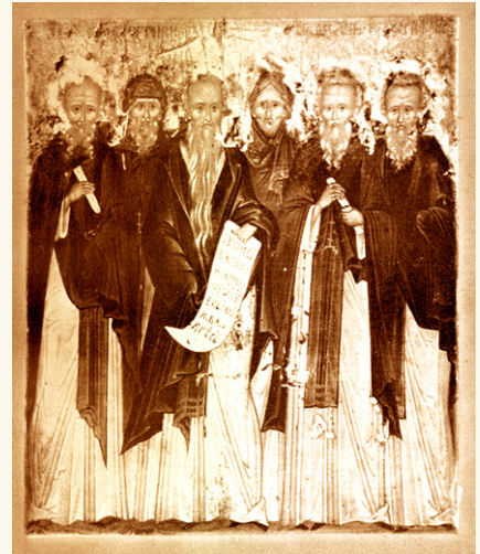
"Selected Saints" Novgorod. 15th century. Snimki drevnikh ikon i staroobriadcheskikh khamrov Rogozhskago Kladbishcha v Moskvie. Moscow, 1913.