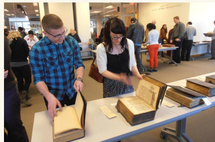
Library patrons view HRL's display of early printed books at the Open House