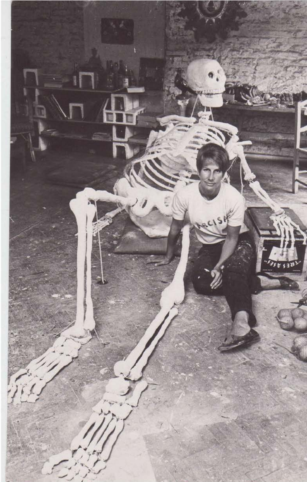
Narcisa Hirsch, Marabunta , 1967, 16 mm, documentary, black & white, color, sound, 7.55 min