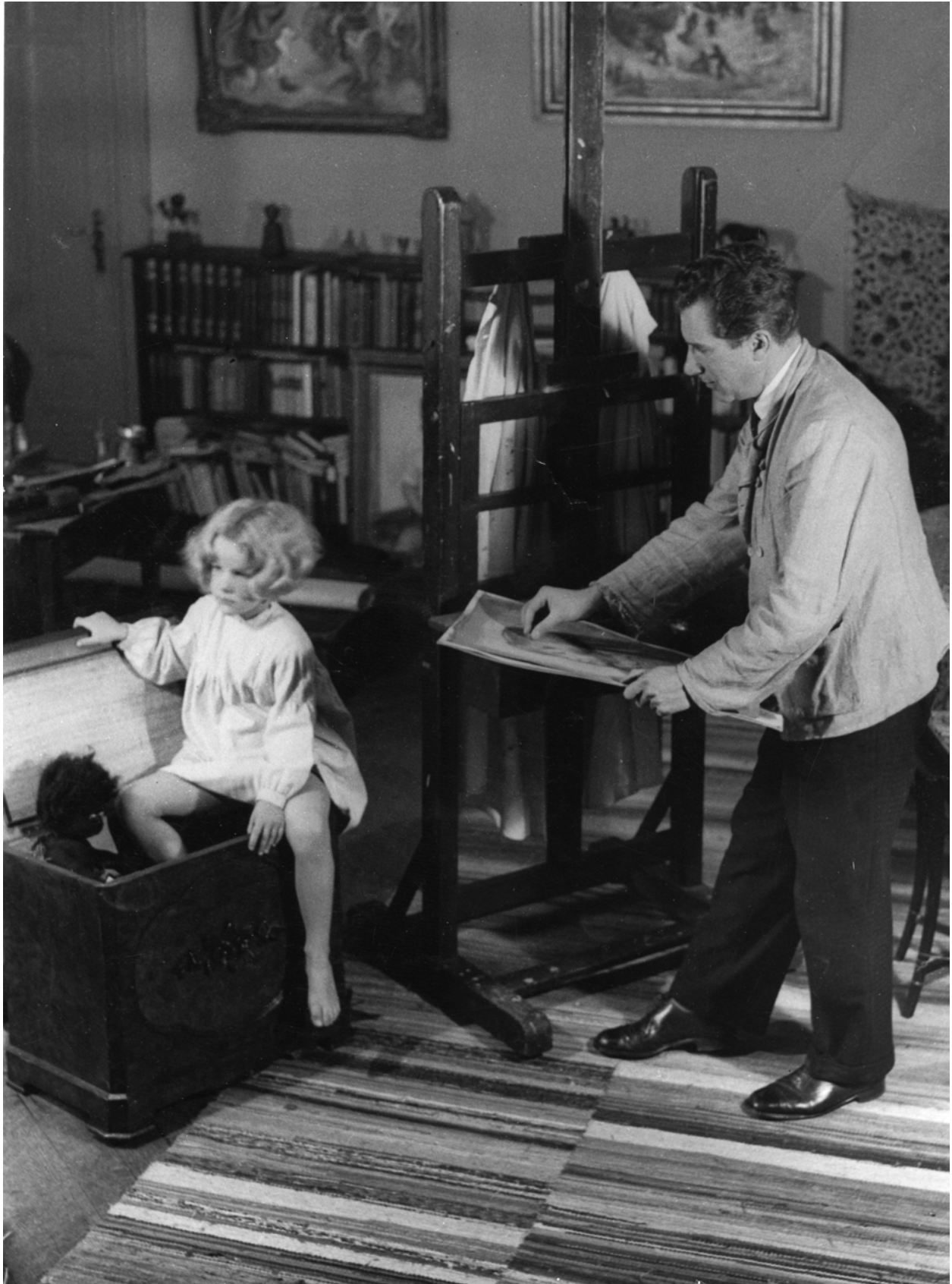
Narcisa Hirsch, El mito de Narciso (The Myth of Narciso), 2011, super 8, 16 mm, video, color, sound, 60 min.