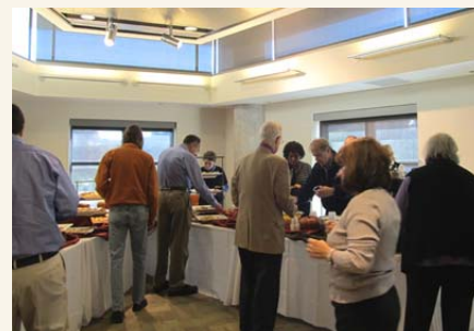
Reception guests enjoying the refreshments