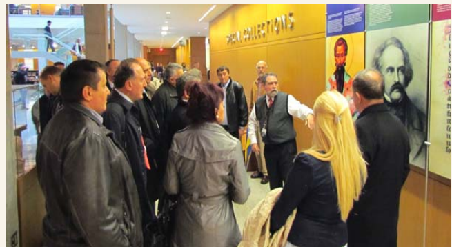
HRL's greater visibility within Thompson's Special Collections is explained