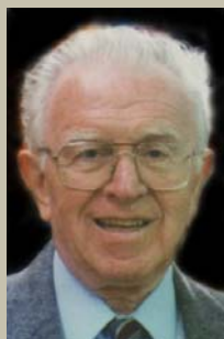
In more recent times