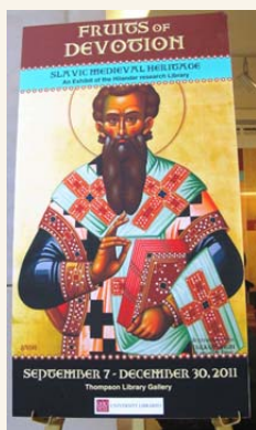
Exhibit Poster in front of the Gallery