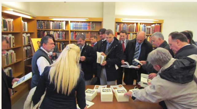
Complimentary copies of HRL's Archival History in Serbian were available in the Special Collections Reading Room