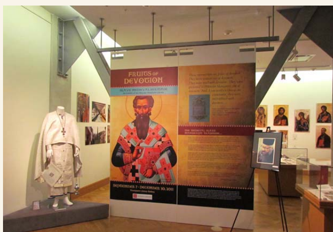
The Thompson Library Exhibit Gallery

Surrounding the texts are images of icons and Hilandar Monastery taken by several different photographers, original iconographic art by Pimen M. Sofronov, and even a set of vestments. The oldest original item dates to the time of Columbus' discovery of America, the most recent, to a unique small booklet of icon models and patterns, which is the only