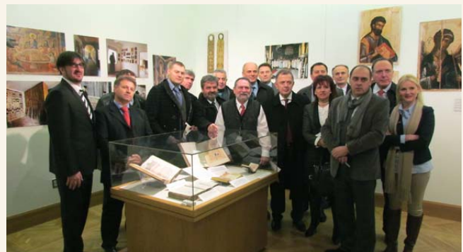
Group photo to commemorate the visit