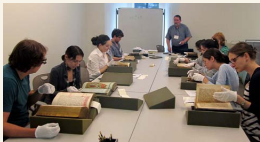
Cotton gloves may be worn to protect the original manuscripts used in the MSSi