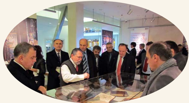
The group views a display case containing original Cyrillic materials