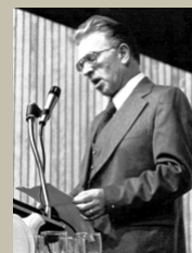
Hilandar Room Dedication 2.XII.1978