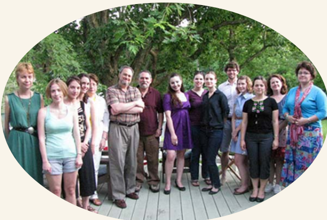
The MSSI participants and staff appreciate the chance to get away from the rigors of the Institute