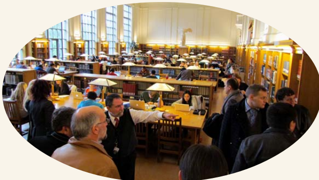
The tour includes a stop to see the restored Grand Reading Room