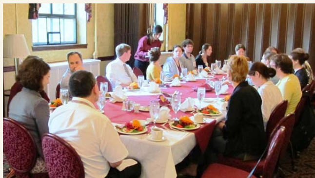
Opening Day luncheon for MSSi participants with remarks from special guests